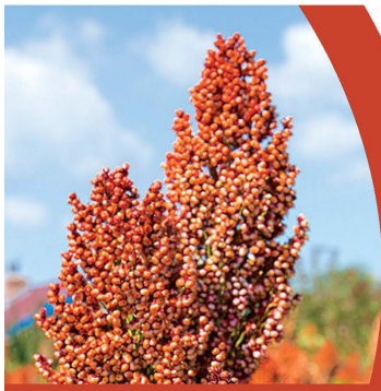
Plate it up!